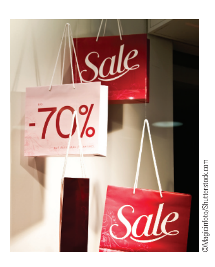
Because consumers respond to incentives, store owners know they can sell off excess inventory by reducing prices.

Marginal choices always involve the effects of net additions to or subtractions from current conditions. In fact, the word additional is often used as a substitute for marginal . For example, a business decision-maker might ask, "What is the additional (or marginal)